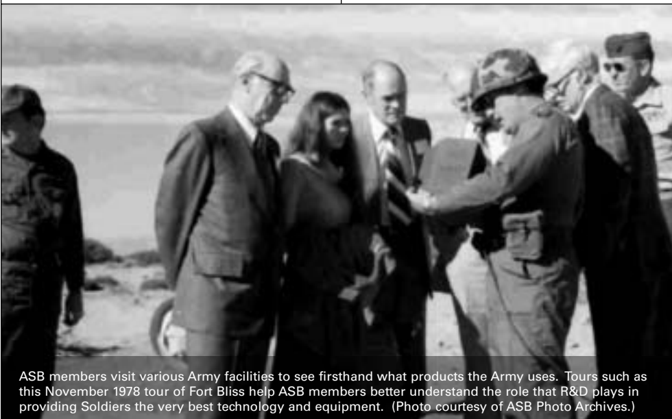
ASB members visit various Army facilities to see firsthand what products the Army uses. Tours such as this November 1978 tour of Fort Bliss help ASB members better understand the role that R&D plays in providing Soldiers the very best technology and equipment.

past half century. Even though these are some of the country's busiest people, these 590 board members have willingly rearranged their complex schedules on short notice to use their own time to solve these significant challenges. They have placed the needs of their country first, and the Army has been fortunate to have, and is grateful for, their generous service. With good fortune, the ASB will continue supporting our Nation long into the future.